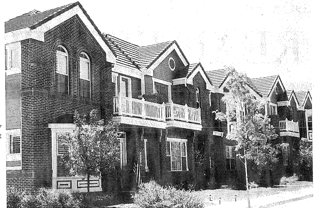
Homes are available to view today.

For more information, call 303-708-1464. Visit online at CenturyCommunities.com